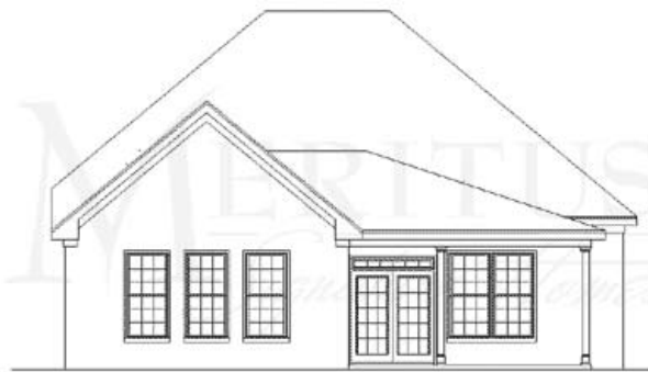
REAR ELEVATION SCALE 1/4" = 1'-0"